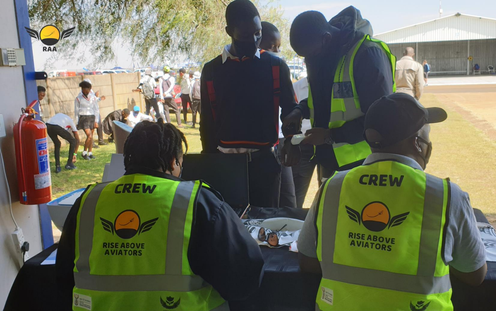
RAA Crew ensuring COVID-19 Protocols are adhered to

This year we boasted a 10 team strong RAA volunteer group who took up duties during the day for education presentations, aviation demonstrations and logistics. A beautiful highlight that we all enjoyed was the award of “Most Enthusiastic” section at the Aero Club of South Africa’s Gala Dinner, the award was a true reflection of our high spirits and determination throughout the weekend.