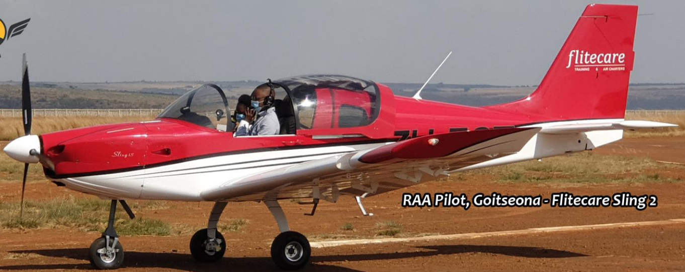
RAA Pilot, Goitseona - Flitecare Sling 2