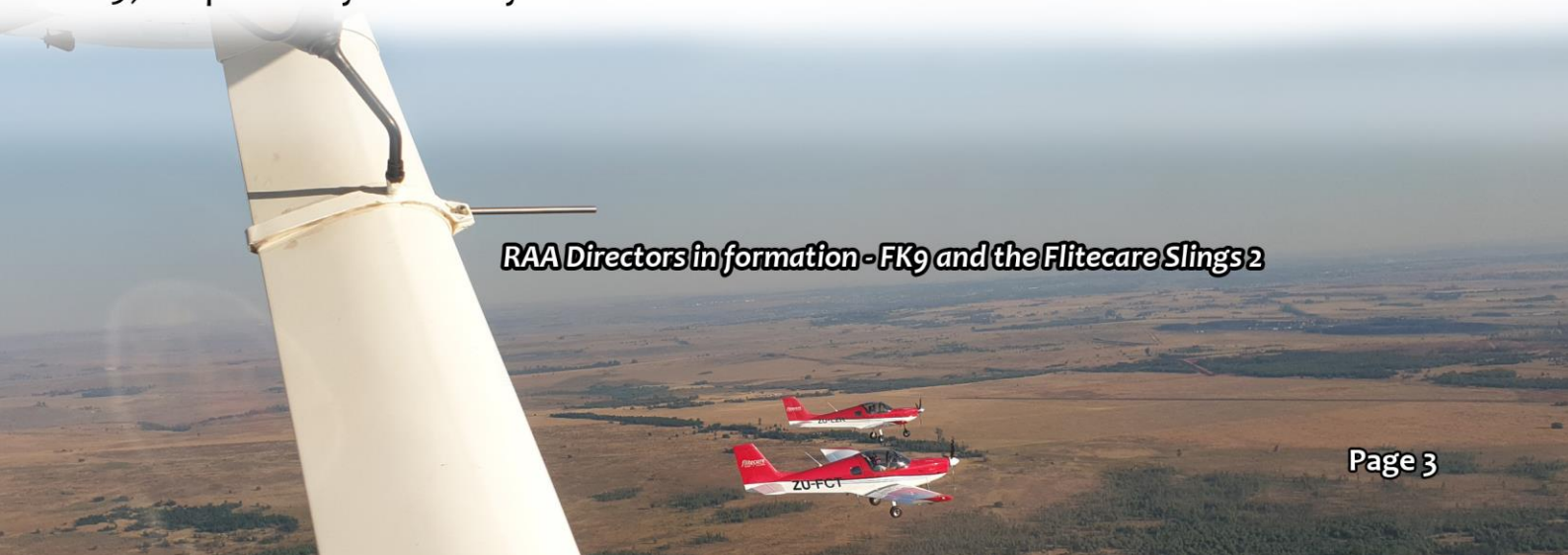
RAA Directors in formation - FK9 and the Flitecare Slings 2

A walk about during the day was an exciting experience for our guests and school learners as they were given an aircraft identification and sightseeing tour. Part of our day's highlights Rise Above Aviators was invited to a live hot air balloon demonstration by BAFSA one of the Aeroclub of South Africa's sections. To wrap up our educational excursion the RAA flying team were so generous by offering our honored school learners with introductory flights in a pair of Sling 2 Aircraft and a FK9, respectfully flown by our directors.